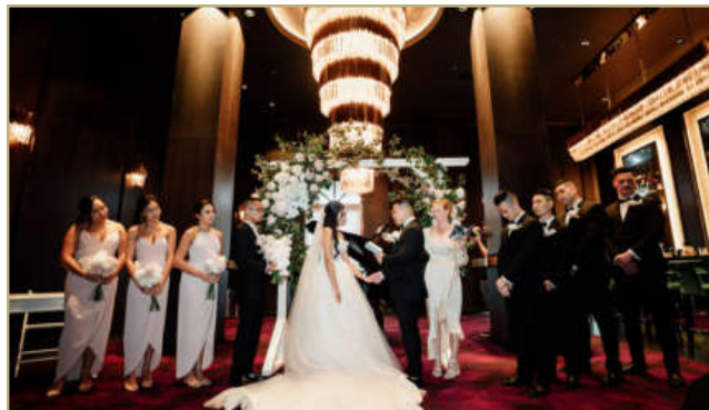
EMERALD FOYER LEVEL 3 (SEATED 30-60)